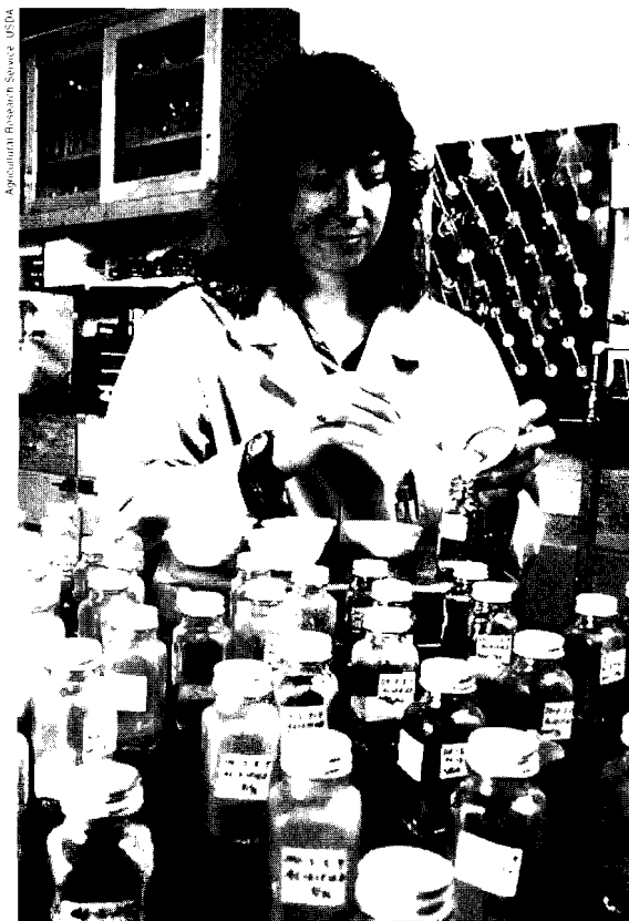
A technician prepares soil samples for their subsequent analyses for various soil carbon fractions. This will help tell scientists how much carbon plants have pulled from atmospheric CO 2 and stored in soil organic matter.