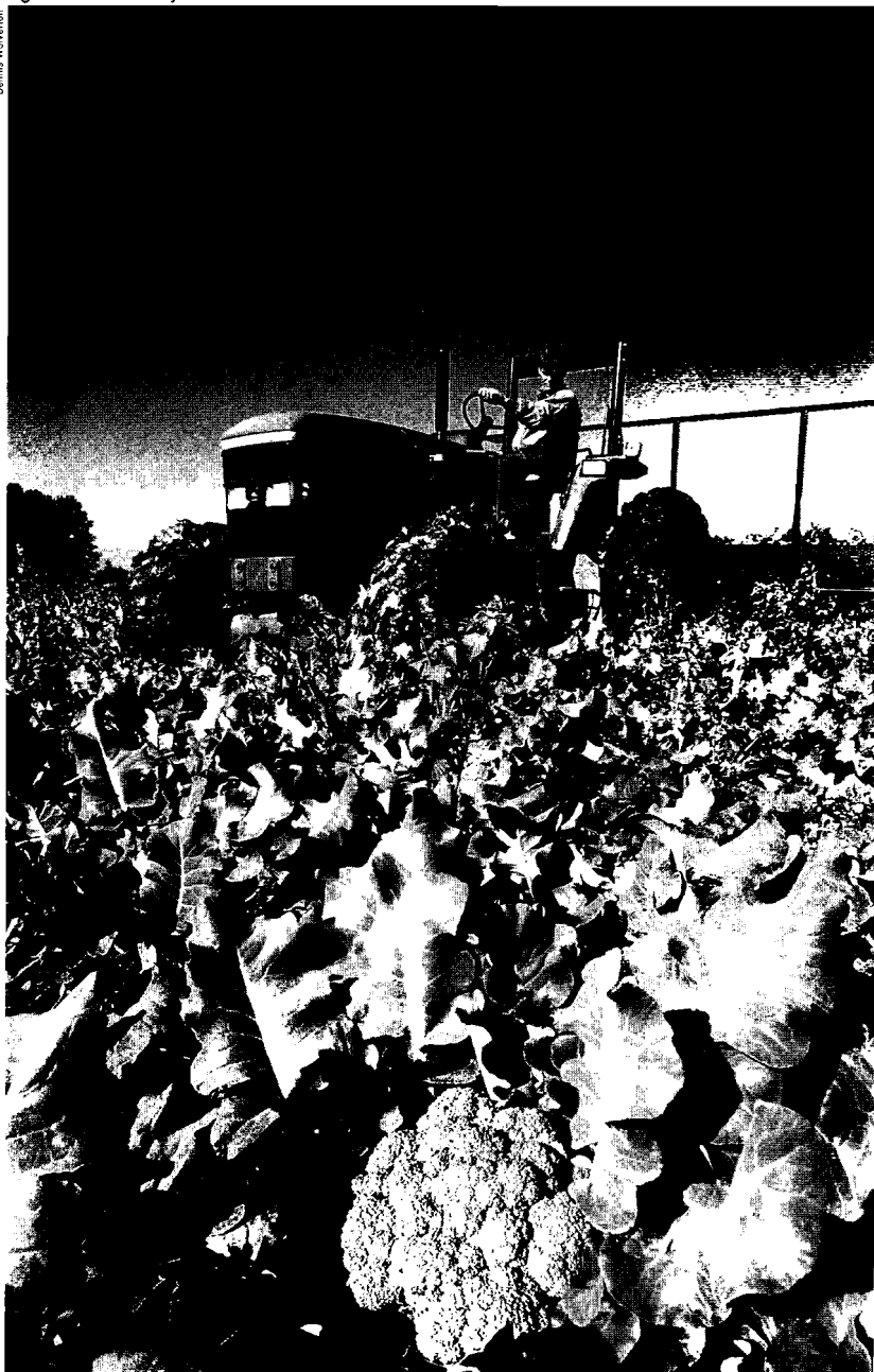
Dennis W. Wernick

Broccoli harvest at Stahlbush Island Farms, an organic and “sustainable agriculture” facility.